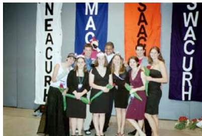
Elon University Delegates